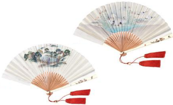
Utagawa Kunihisa II, folding fan showing kite flying [recto – left] and Mount Fuji (verso – right). Probably acquired by Queen Mary.