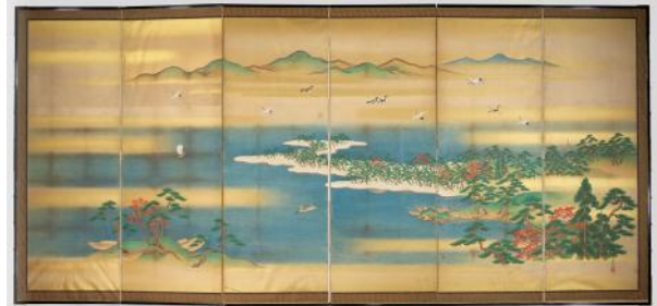
Itaya Hiroharu, folding screen paintings , 1860. Sent to Queen Victoria by Shōgun Tokugawa Iemochi, 1860.