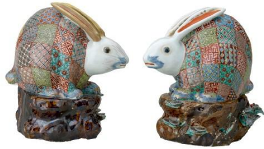
Arita, Hizen Province, pastille burners in the form of hares, 1680–1720. Purchased by George IV when Prince Regent, 1818.