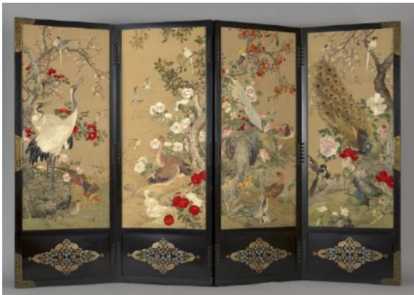
Iida & Co., Kyoto, Japan, embroidered folding screen , c.1880–1900. Sent to King Edward VII for his Coronation by the Emperor Meiji in 1902.

Images are available to download via WeTransfer .