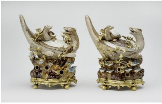
Arita, Hizen Province (porcelain), France (mounts), pastille burners in the form of tortoises , 1680–1700 (porcelain), 1700–50 (mounts). Acquired by George IV.