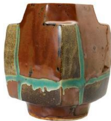
Hamada Shōji, square vessel, 1960–75. Presented to Her Majesty The Queen during her State Visit to Japan, 1975.