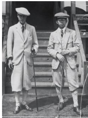
[L] Press Association, Group photograph taken on the occasion of Edward, Prince of Wales's visit to Japan , 16 April 1922.