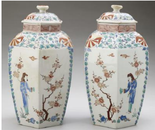
Arita, Hizen Province, hexagonal jars and covers , 1670–90. Acquired by Mary II.