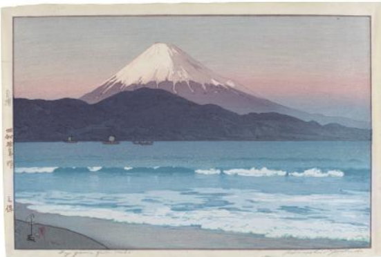
Yoshida Hiroshi, Mount Fuji from Miho , 1935. Probably acquired by Queen Mary.