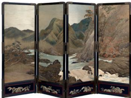
Kyoto, Japan, embroidered folding screen , 1880–97. Sent to Queen Victoria by the Emperor Meiji for her Diamond Jubilee, 1897.