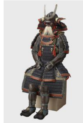
Myōchin school of armourers, armour , 1537–1850. Presented to Prince Alfred, Duke of Edinburgh by the Emperor Meiji in 1869.