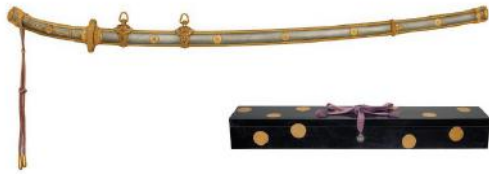
Gassan Sadakazu, Field Marshal's sword and box , 1918. Sent to King George V by the Emperor Taishō, 29 October 1918.