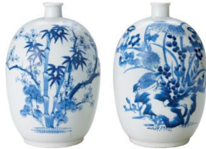
Arita, Hizen Province saké bottles , 1840–60. Sent to Queen Victoria by Shōgun Tokugawa Iemochi, 1860.