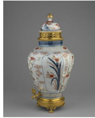
Arita, Hizen Province (porcelain), France (mounts), jar and cover , 1690–1720 (porcelain), 1780–1820 (mounts). Purchased by George IV in 1820.