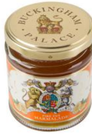
Buckingham Palace Marmalade, £3.95