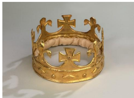
The dress, robe and coronet worn by Princess Elizabeth to her parents' coronation in May 1937.