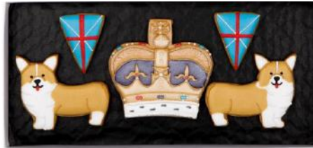
Biscuiteers Corgi Biscuit Box, £25