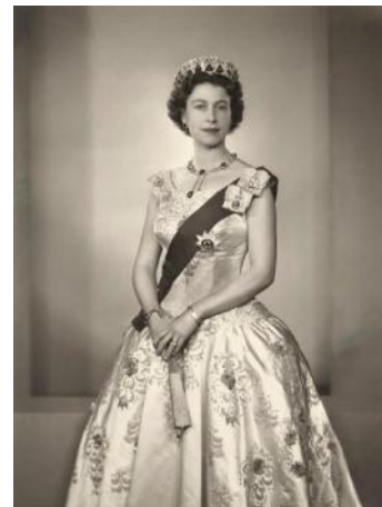
HM Queen Elizabeth II, May 1956

The Queen wears the South Africa necklace.