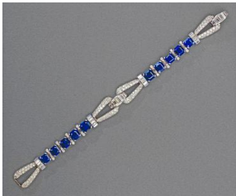
Cartier, Sapphire and Diamond Bracelet , c. 1920