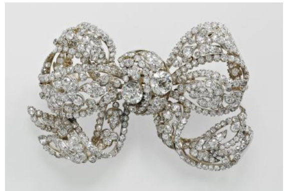
Carrington & Co., Queen Mary's Dorset Bow Brooch , 1893