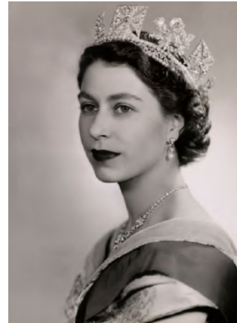
HM Queen Elizabeth II, 15 April 1952

The Queen wears The Girls of Great Britain and Ireland Tiara.