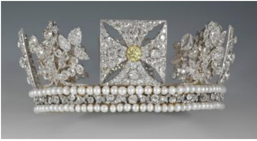
Rundell, Bridge & Rundell, Diamond Diadem , 1820–1