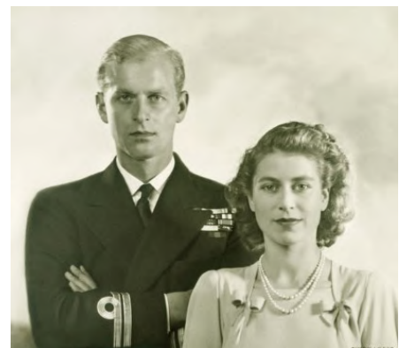
Official engagement portrait of Princess Elizabeth and Lieutenant Philip Mountbatten taken by Dorothy Wilding in July 1947.