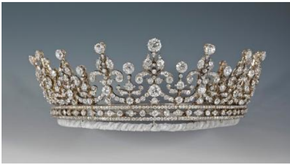
E. Wolff & Co for R. & S. Garrard & Co, The Girls of Great Britain and Ireland Tiara , 1893