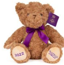
Platinum Jubilee Teddy Bear, £19.95