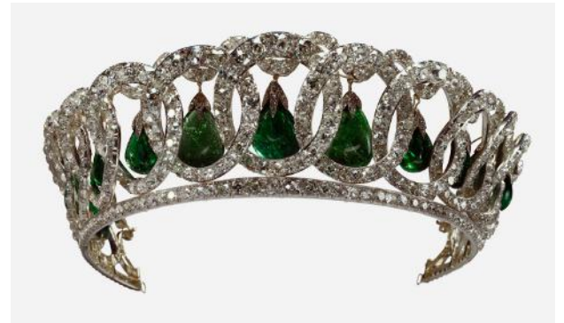
Attributed to Bolin, The Vladimir Tiara , c. 1874