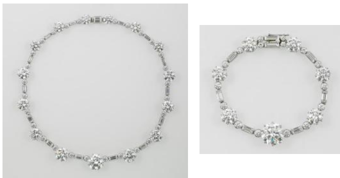
Garrard & Co. Ltd, The South Africa Necklace and Bracelet , 1947-52