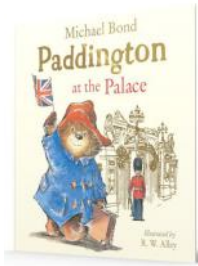
Paddington at the Palace by Michael Bond, £6.99