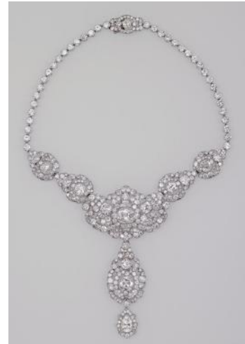
Cartier, The Nizam of Hyderabad Necklace , 1935