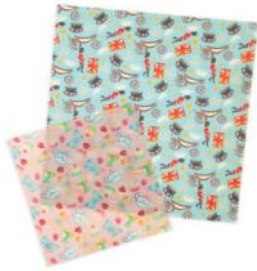
Buckingham Palace Beeswax Wraps, £15.95