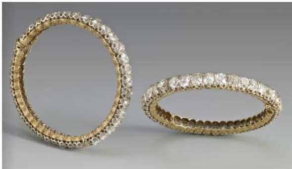
Queen Mary's Bangles, late 19th century