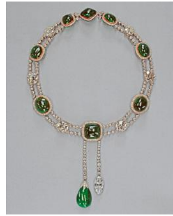
Garrard & Co. Ltd, Delhi Durbar Necklace , 1911