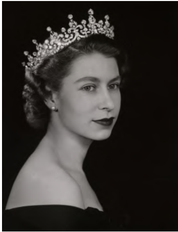
HM Queen Elizabeth II, 26 February 1952

The Queen wears The Girls of Great Britain and Ireland Tiara.