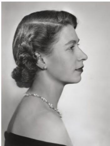
Her Majesty Queen Elizabeth II, 26 February 1952

The Queen wears the Diamond Diadem and the Nizam of Hyderabad necklace.