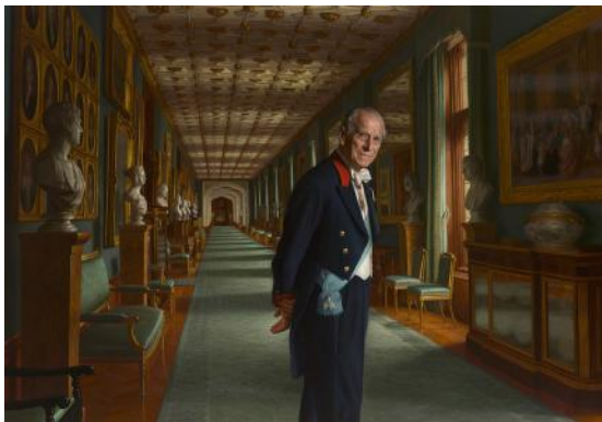
HRH The Duke of Edinburgh, 2017, Ralph Heimans