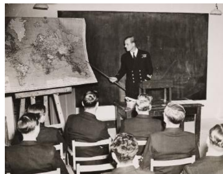
Prince Philip teaching naval cadets at HMS Royal Arthur in Corsham, Wiltshire, 1947

Credit line: Royal Collection Trust / All Rights Reserved Images are available to download at mediaselect.pa.media