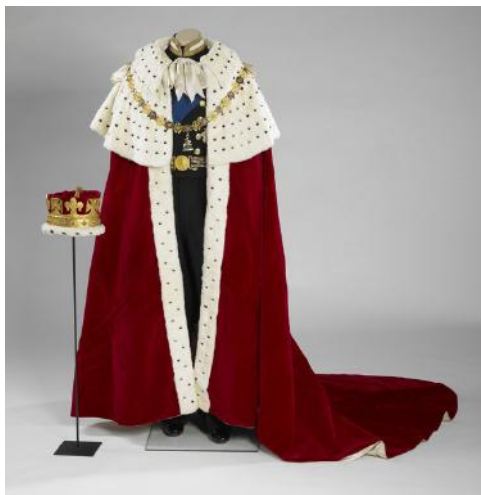
The Coronation Robe and Coronet worn by HRH The Prince Philip, Duke of Edinburgh during Her Majesty The Queen's Coronation on 2 June 1953

For further information please contact the Royal Collection Trust Press Office, press@rct.uk or +44 (0)20 7839 1377.