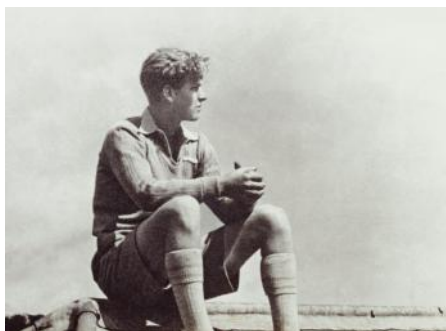
HRH The Duke of Edinburgh when Prince Philip of Greece at Gordonstoun School, c.1938