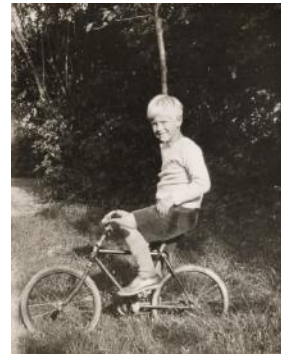
HRH The Duke of Edinburgh when Prince Philip of Greece on a bicycle at Saint-Cloud, Paris, 1929