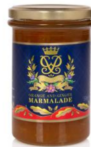
Orange and Ginger Marmalade, £5.95