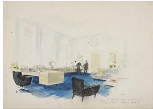
Sir Hugh Casson's sketch for Prince Philip's study at Buckingham Palace, 1957