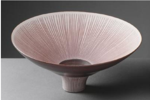
Bowl, c.1930-60, Dame Lucie Rie © Estate of the Artist