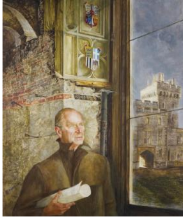
George A Weymouth's portrait of Prince Philip standing in the shell of St George's Hall in Windsor Castle after the fire of 1992, holding a roll of floorplans.