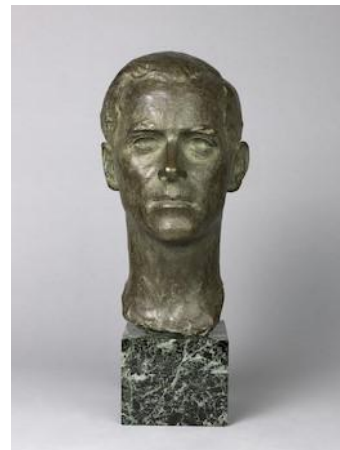
HRH The Duke of Edinburgh, 1956-57, Vincent Apap