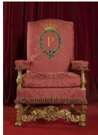
The Chair of Estate made for Prince Philip after the Coronation to accompany The Queen's Chair of Estate in the Throne Room at Buckingham Palace