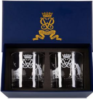
Pair of Whisky Tumblers (Special Edition), £65.00