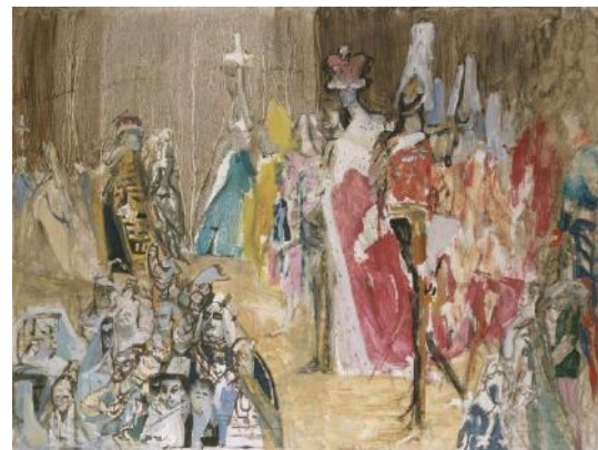
The Coronation III, 1959-60, Feliks Topolski Royal Collection Trust / All Rights Reserved