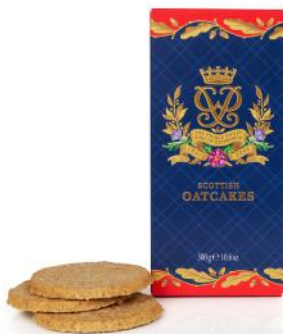
Scottish Oatcakes, £4.95