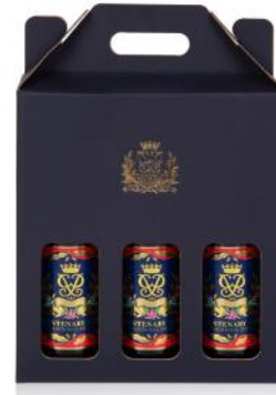
Centenary Ale Three Bottle Gift Pack, £16.00