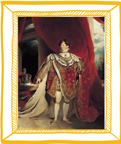
George IV 1820

A portrait is a painting or a photograph of a person. For hundreds of years Kings and Queens have had portraits painted or taken for their Coronation. In their portraits they are shown with special clothes and objects.