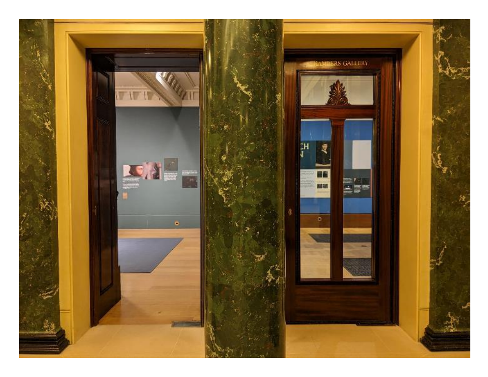
To the left is the Millar Learning Room:

There are two more space to see, the Millar Room and Baby Chambers. Turn right and walk past the desk at the top of the stairs and into either of the doors in front of you.