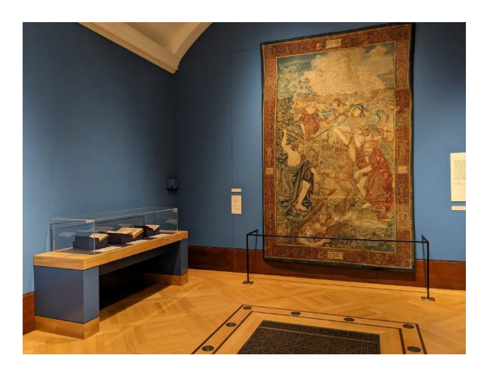
In some spaces there are glass cases, and the glass can be difficult to see: