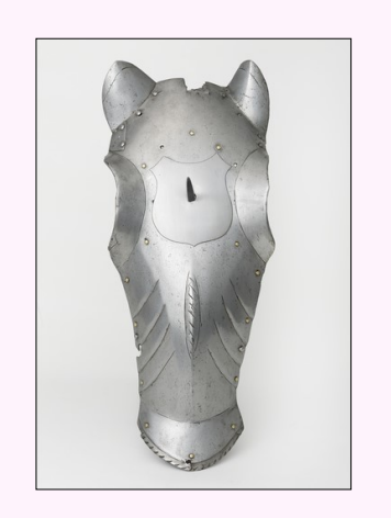
A horse's helmet