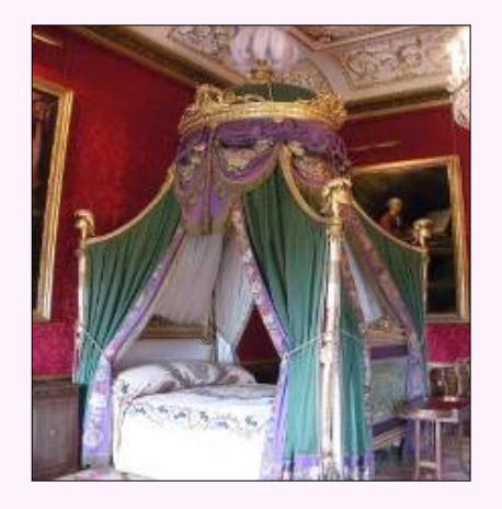
A King's bed