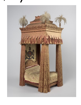
4 Foster bed 🗖