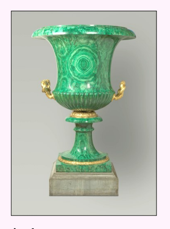
A huge vase