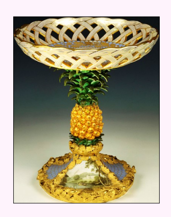
A pineapple plate \Box