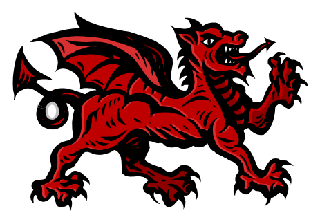
8. In the Doll's House, try to find.....