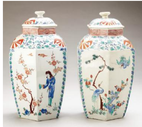
Arita, Hizen Province, Two hexagonal jars and covers, 1670–90. Probably part of Mary II's collection at Hampton Court Palace.