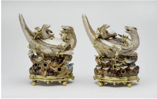
Arita, Hizen Province (porcelain), France (mounts), Pair of pastille burners in the form of tortoises, 1680–1700 (porcelain), 1700–50 (mounts). Acquired by George IV.