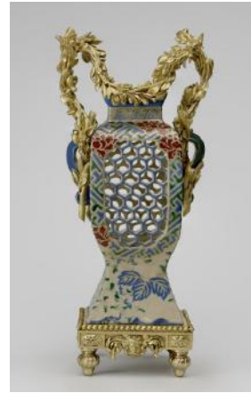
Kyoto (porcelain), France (mounts), Mounted vessel, 1700–75 (stoneware), 1750–75 (mounts). Probably acquired by George IV.