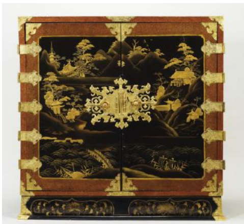
Japan (cabinet), France (stand), Cabinet on stand, c.1640–90 (cabinet), c.1704/5 (stand). Possibly acquired by Queen Caroline, consort of George II.