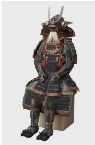
Myōchin school of armourers, Armour, 1537–1850, Presented to Prince Alfred, Duke of Edinburgh by the Emperor Meiji in 1869.