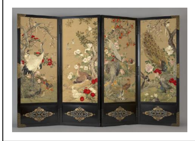
lida & Co., Kyoto, Japan, embroidered folding screen, c.1880–1900. Sent to King Edward VII for his Coronation by the Emperor Meiji in 1902.

Images are available to download via WeTransfer.