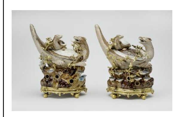
Arita, Hizen Province (porcelain), France (mounts), pastille burners in the form of tortoises, 1680–1700 (porcelain), 1700–50 (mounts). Acquired by George IV.