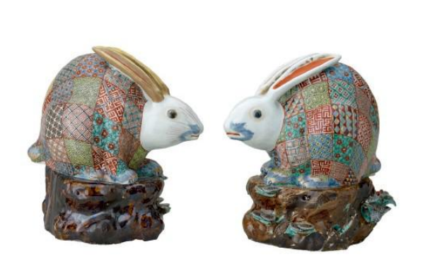
Arita, Hizen Province, pastille burners in the form of hares, 1680–1720. Purchased by George IV when Prince Regent, 1818.