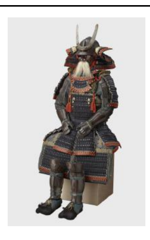
Myōchin school of armourers, armour, 1537–1850. Presented to Prince Alfred, Duke of Edinburgh by the Emperor Meiji in 1869.