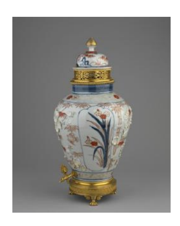
Arita, Hizen Province (porcelain), France (mounts), jar and cover, 1690–1720 (porcelain), 1780–1820 (mounts). Purchased by George IV in 1820.