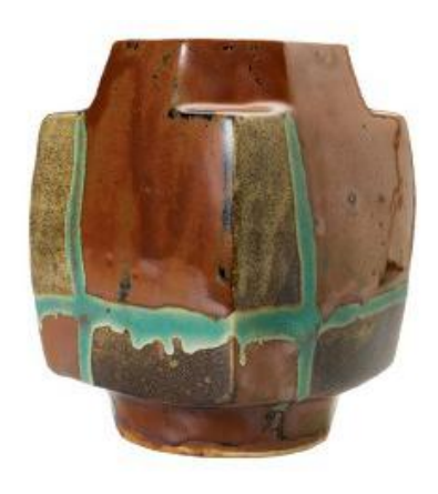
Hamada Shōji, square vessel, 1960–75. Presented to Her Majesty The Queen during her State Visit to Japan, 1975.