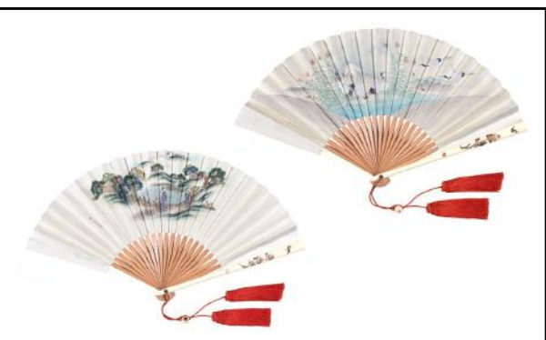
Utagawa Kunihisa II, folding fan showing kite flying [recto – left) and Mount Fuji (verso – right). Probably acquired by Queen Mary.