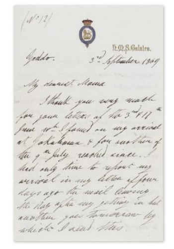
Prince Alfred, Duke of Edinburgh, letter to Queen Victoria, Edo, 3 September 1869.