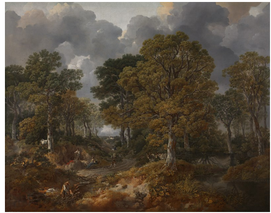
Thomas Gainsborough, Cornard Wood , c.1748, © The National Gallery, London