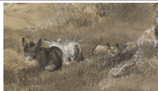
Thomas Gainsborough, Wooded landscape with donkeys , c.1746-48, (detail)

Credit line for all images unless otherwise specified: