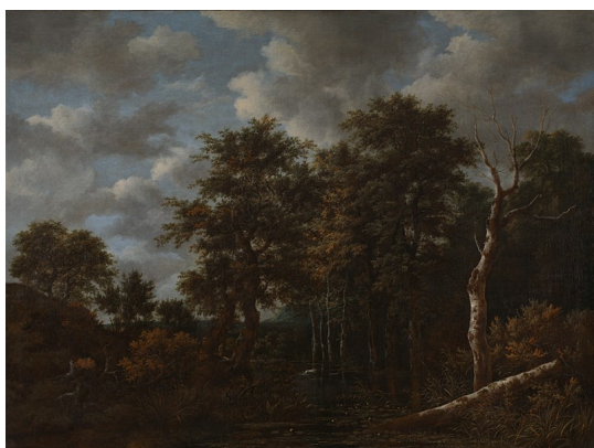
Jacob van Ruisdael, A Pool surrounded by Trees, and Two Sportsmen coursing a Hare , c. 1665, © The National Gallery, London

Exhibition curator Rosie Razzall examines reattributed drawings by Thomas Gainsborough contained in an album titled 'Sketches by Sir E Landseer'. The drawings were misattributed to Landseer for over a century.