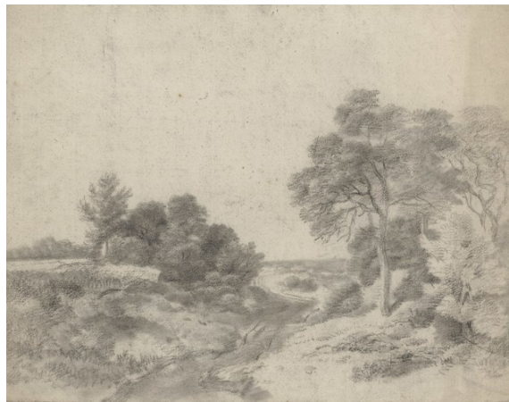
Thomas Gainsborough, Trees beside a path winding into the distance , c.1748-50