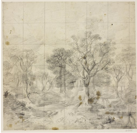
Thomas Gainsborough, Study for Cornard Wood , c.1748