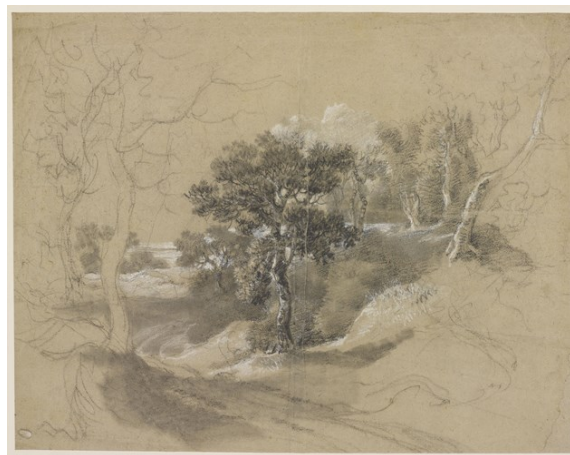
Thomas Gainsborough, Tree beside a descending path , c.1746-48