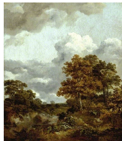
Thomas Gainsborough, Landscape with a Pool , c.1746-47, © Fitzwilliam Museum, Cambridge