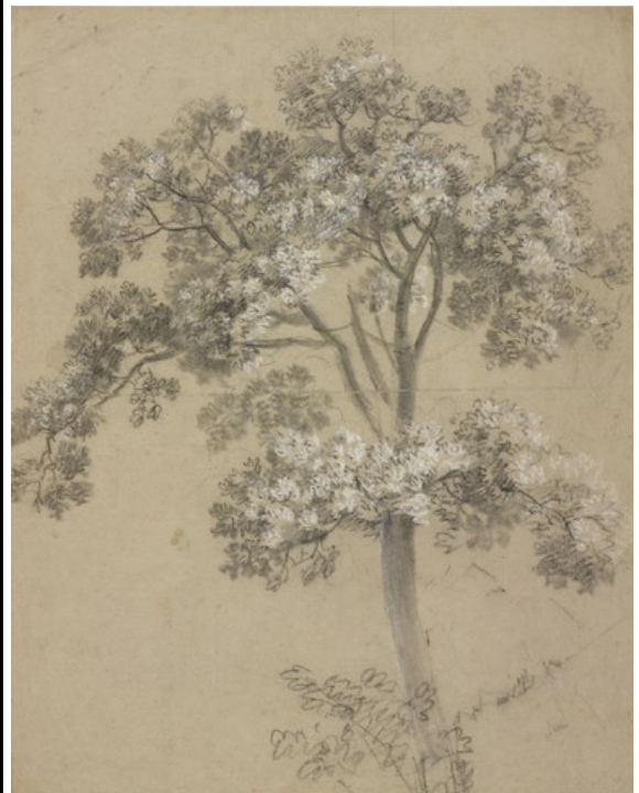
Thomas Gainsborough, Study of a tree, possibly a sycamore , c.1746-48