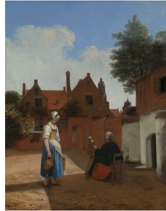
Pieter de Hooch, A Courtyard in Delft at Evening: a Woman spinning , 1657

The Queen's Gallery, Palace of Holyroodhouse 25 March—25 September 2022