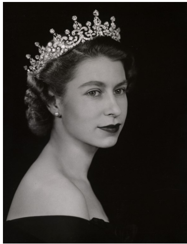
HM Queen Elizabeth II, 1952