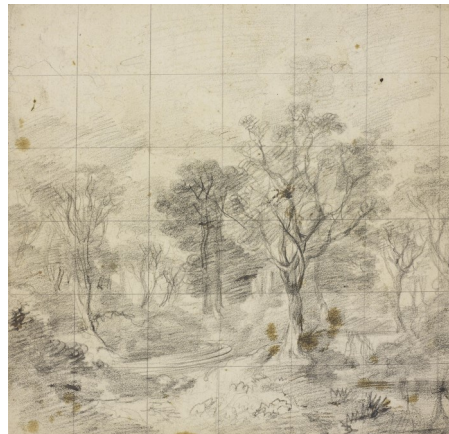
Thomas Gainsborough, Study for Cornard Wood , c.1748

National Gallery of Ireland, 5 March – 12 June 2022 Nottingham Castle, 2 July – 25 September 2022