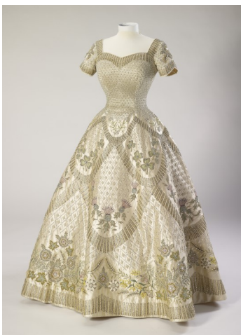
Her Majesty The Queen's Coronation Dress, designed by Sir Norman Hartnell, and Coronation Robe by Ede & Ravenscroft, 1953

Windsor Castle, 7 July – 26 September 2022