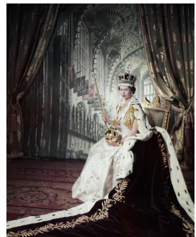
Cecil Beaton, Queen Elizabeth II on her Coronation Day , 1953