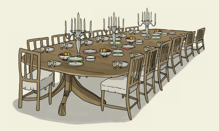
Royal Dining Room