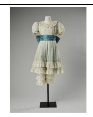
The blue taffeta dress overlaid with cream coloured lace and matching cream lace bloomers worn by Princess Margaret to play 'The Hon. Lucinda Fairfax' in Old Mother Red Riding Boots in 1944.