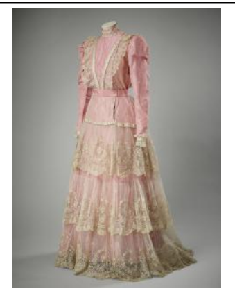
The pink satin dress with lace overlay worn by Princess Elizabeth to play 'Lady Christina Sherwood' in Old Mother Red Riding Boots in 1944.