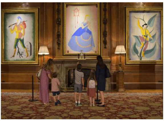
The 16 colourful 'pantomime pictures' that were pasted into empty frames in the Waterloo Chamber to decorate the space for the pantomimes are currently on display for visitors to Windsor Castle.