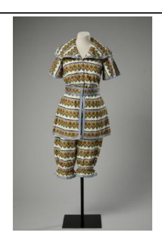
The chintz shirt and trousers worn by Princess Elizabeth in Old Mother Red Riding Boots in 1944.