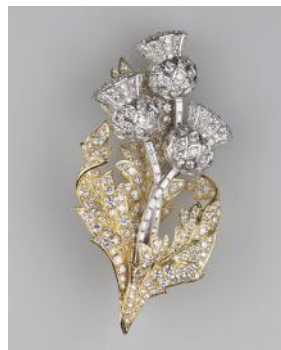
The Queen's Thistle of Scotland Brooch