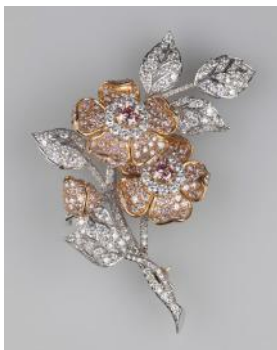
The Queen's Rose of England Brooch