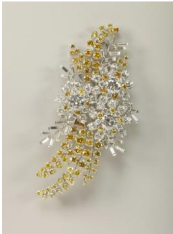
Australian Wattle Brooch, 1954