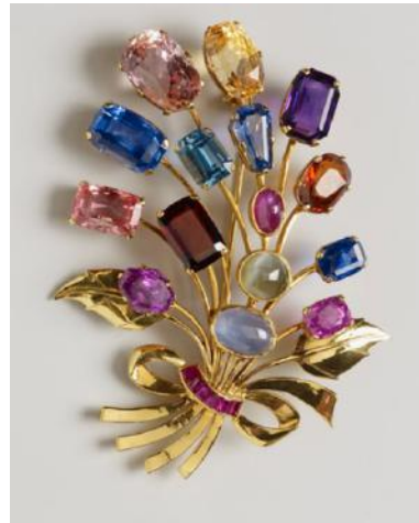
Sri Lanka Brooch, 1981