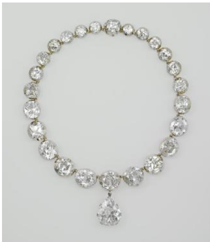
R. & S. Garrard & Co., The Coronation Necklace, 1858