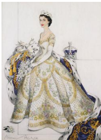
Sir Norman Hartnell, Her Majesty The Queen in Coronation Robes , 1953