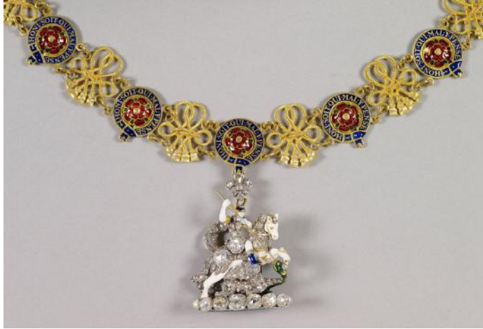
Rundell, Bridge and Rundell, The Queen's Garter Collar and Collar Badge (Great George)

Images are available here via WeTransfer.