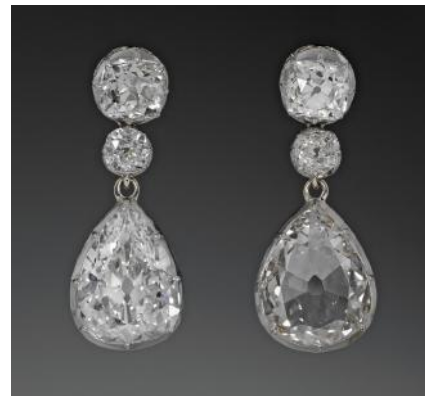
R. & S. Garrard & Co., The Coronation Earrings, 1858