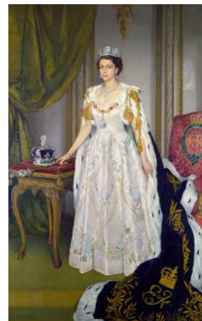
Sir Herbert James Gunn, Queen Elizabeth II in Coronation Robes , c.1953-56