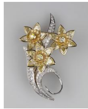
The Queen's Daffodil of Wales Brooch