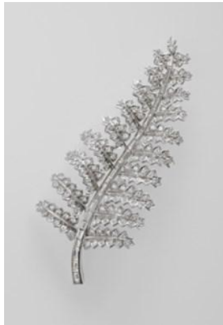
Silver Fern Brooch, 1953