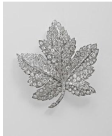
Asprey & Co., Canadian Maple-leaf Brooch, 1939