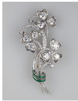
The Queen's Shamrock of Northern Ireland Brooch