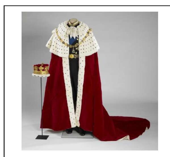
The Coronation Robe and Coronet worn by HRH The Prince Philip, Duke of Edinburgh during Her Majesty The Queen's Coronation on 2 June 1953

For further information please contact the Royal Collection Trust Press Office, <u>press@rct.uk</u> or +44 (0)20 7839 1377.