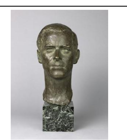
HRH The Duke of Edinburgh, 1956-57, Vincent Apap