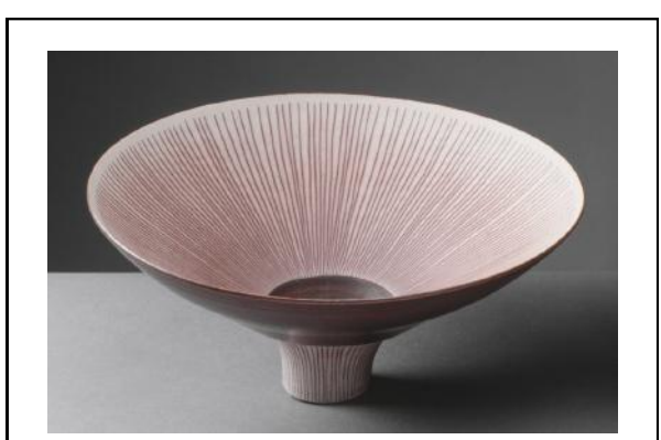
Bowl, c. 1930-60, Dame Lucie Rie