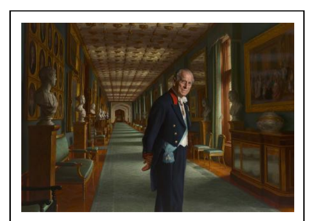
HRH The Duke of Edinburgh, 2017, Ralph Heimans Royal Collection Trust / All Rights Reserved