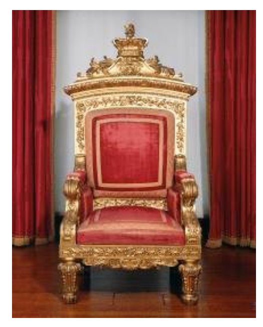
Dowbiggin & Co Queen Victoria's Throne 1837 Carved gilt wood, velvet RCIN 2608

This is the throne that was made for Victoria when at the age of nineteen, she was crowned Queen of Great Britain. Made of carved gilt wood, the throne chair is upholstered in crimson velvet and lacework. On the top rail is a carved crown and national emblems. The frame is elaborately decorated with oak and acanthus leaves and laurel with berries – all symbols of power, strength and elegance. On the back of the throne are the emblems of Great Britain –