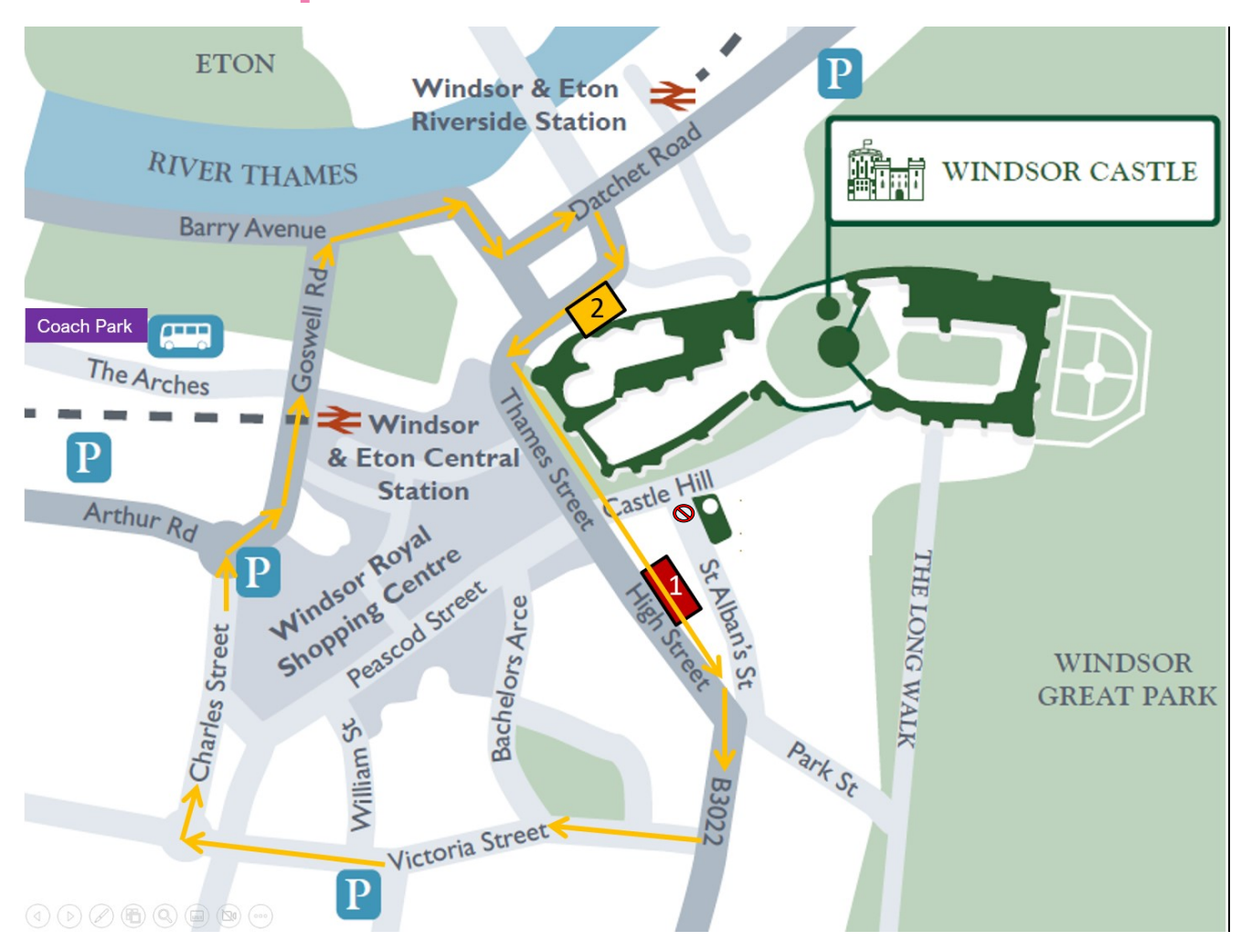
Note St. Alban's Street is now a no through road.